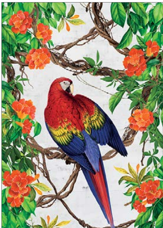
TCR 59 printed on rice paper 40 gr TCE 59 printed on Easy paper 60 gr