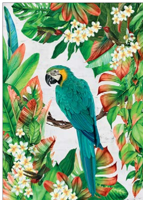
TCR 64 printed on rice paper 40 gr TCE 64 printed on Easy paper 60 gr