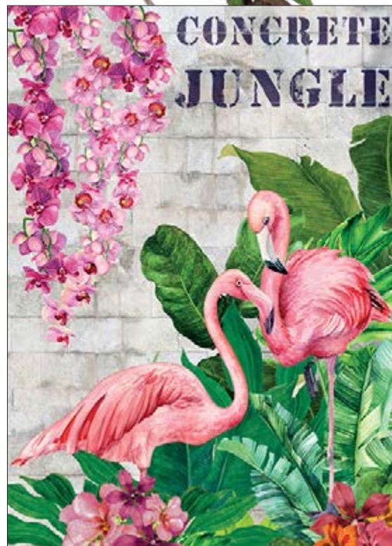
TCR 61 printed on rice paper 40 gr TCE 61 printed on Easy paper 60 gr