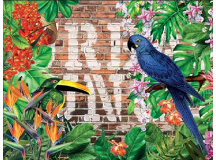
TCR 60 printed on rice paper 40 gr

These lovely papers will stimulate your creativity and will make your creations unique.