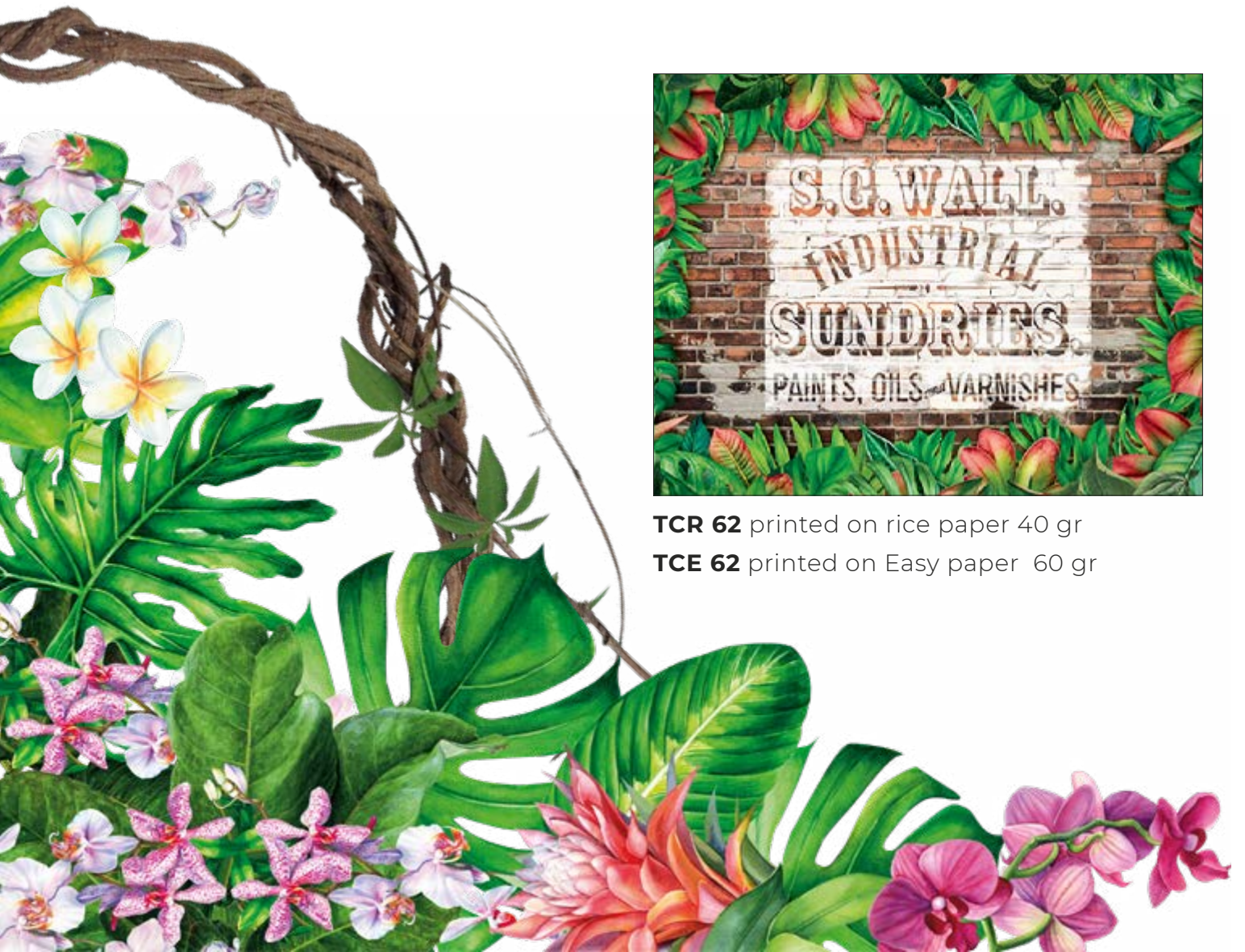
TCR 62 printed on rice paper 40 gr