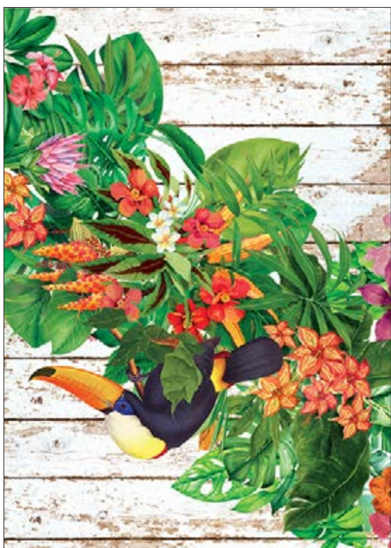
TCR 63 printed on rice paper 40 gr TCE 63 printed on Easy paper 60 gr