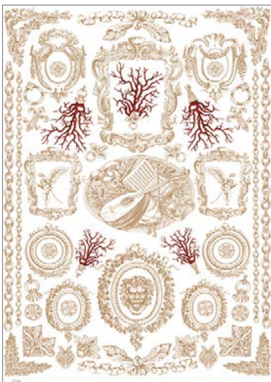
*PAU 81 (gold hot foil printing)

*PAU · 34,5 x 49,5 cm, printed with gold hot foil on mulberry paper (rice paper) 25 gr