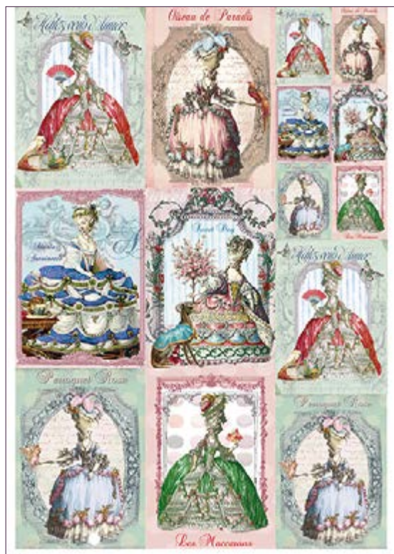
DGR 258 printed on rice paper 40 gr DGE 258 printed on Easy paper 60 gr