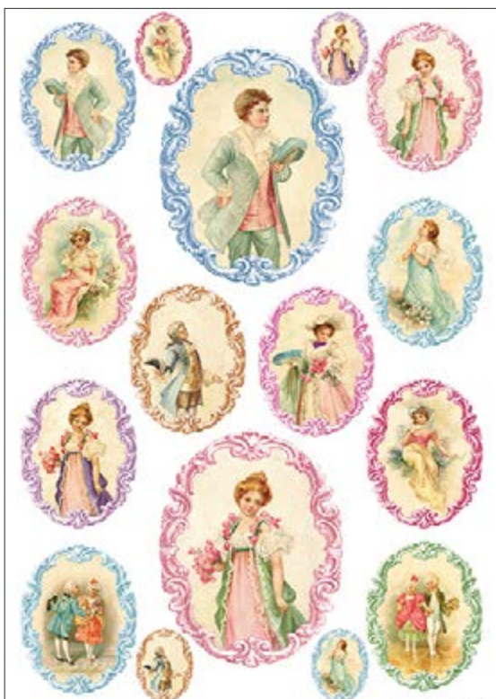
DGR 257 printed on rice paper 40 gr DGE 257 printed on Easy paper 60 gr