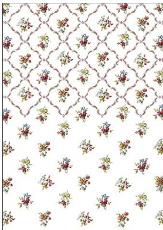
DGR 262 printed on rice paper 40 gr