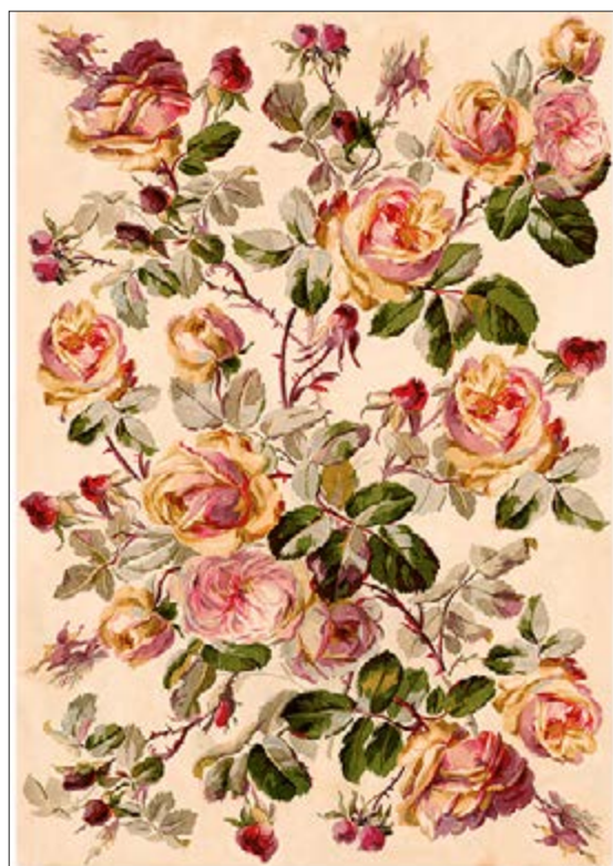
DGR 254 printed on rice paper 40 gr DGE 254 printed on Easy paper 60 gr