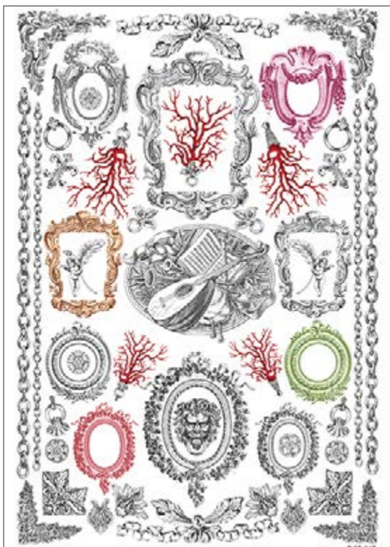
DGR 245 printed on rice paper 40 gr

DGR · 32 x 45 cm, printed on Easy paper 60 gr