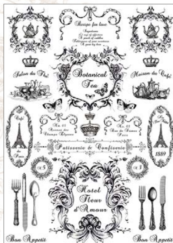
DGR 247 printed on rice paper 40 gr