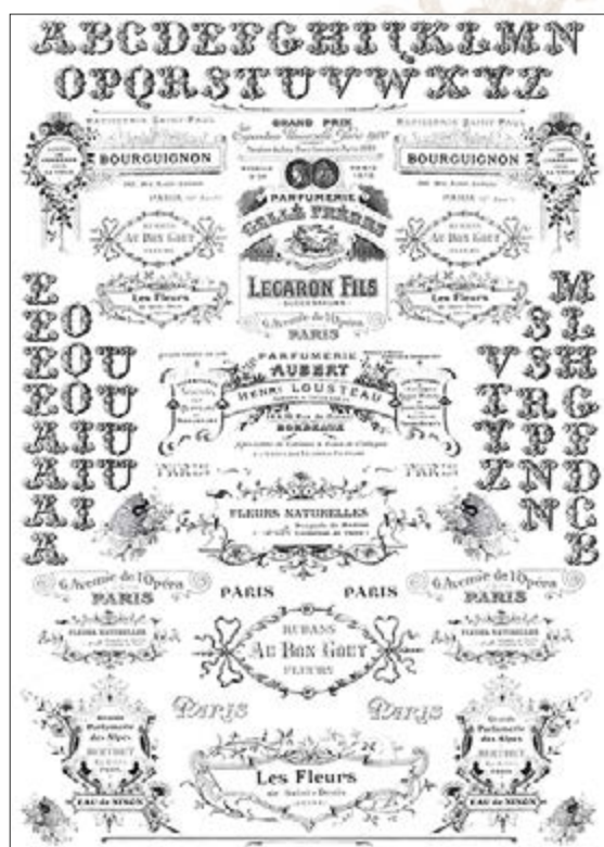
DGR 248 printed on rice paper 40 gr