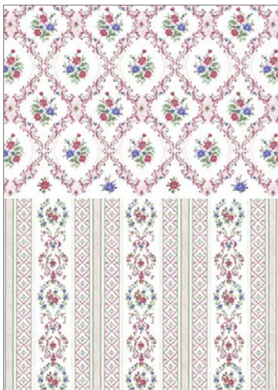
DGR 259 printed on rice paper 40 gr

The collection is inspired by the Baroque era, characterized by the style of the gorgeous and elegant French salons between the early 16th and the late 17th centuries. In Baroque art, the cherubs were used as a decorative motif of frames, frescoes and sculpture.s