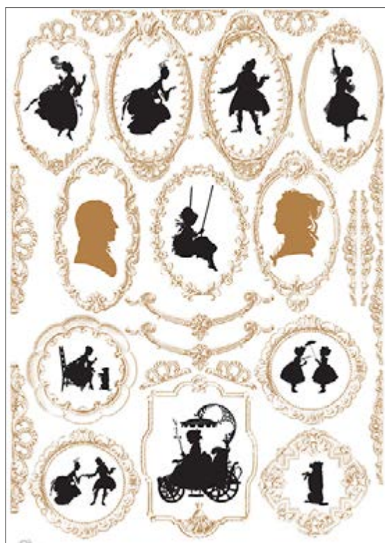
*PAU 82 (gold hot foil printing)

DGR · 32 x 45 cm, printed on mulberry paper (rice paper) 40 gr