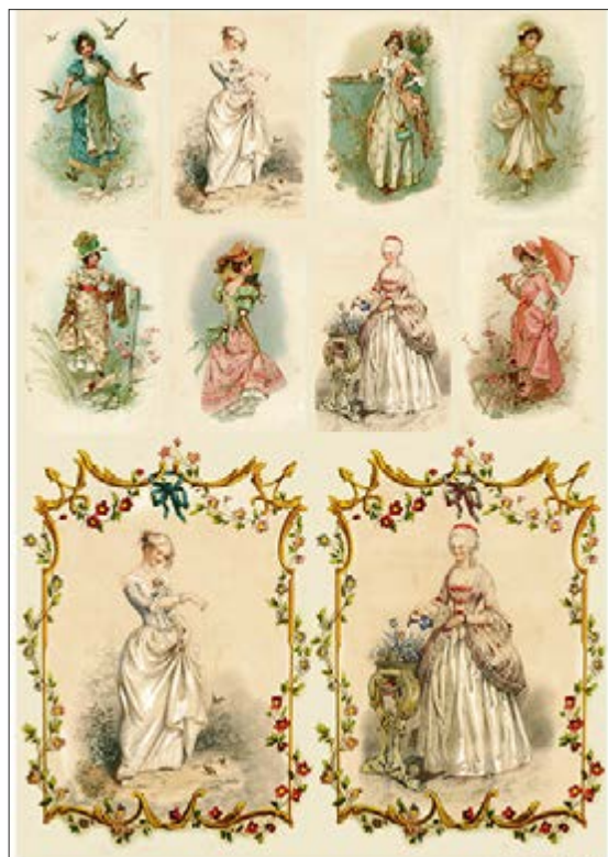
DGR 256 printed on rice paper 40 gr DGE 256 printed on Easy paper 60 gr