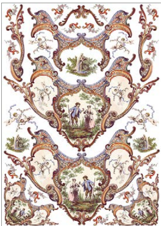
DGR 251 printed on rice paper 40 gr DGE 251 printed on Easy paper 60 gr

The baroque decoration was characterized by gilded frames enriched by inlays representing leaves and cherubs, to recreate, through the dramatic contrast between light and dark, an effect of astonishment and surprise.