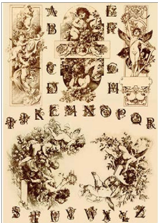
DGR 255 printed on rice paper 40 gr DGE 255 printed on Easy paper 60 gr

This collection draws inspiration also from the fashion of the time, especially from Marie Antoinette's style, icon of beauty and eccentricity.