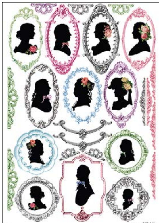
DGR 246 printed on rice paper 40 gr