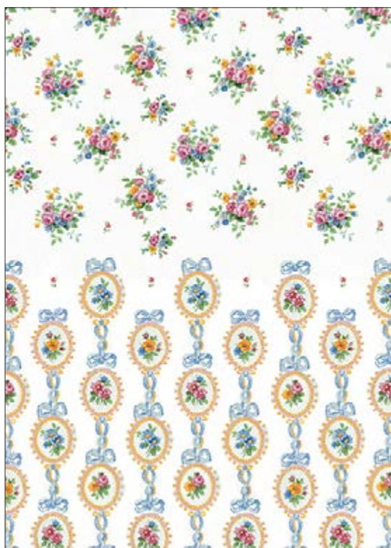
DGR 261 printed on rice paper 40 gr