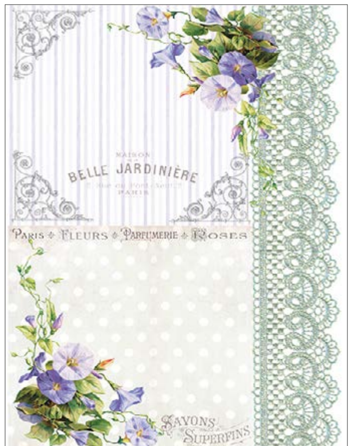
TCR 18 printed on rice paper 40 gr