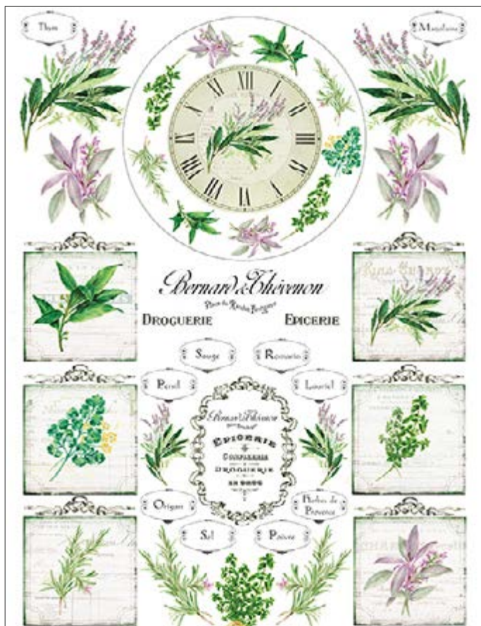
TCR 17 printed on rice paper 40 gr