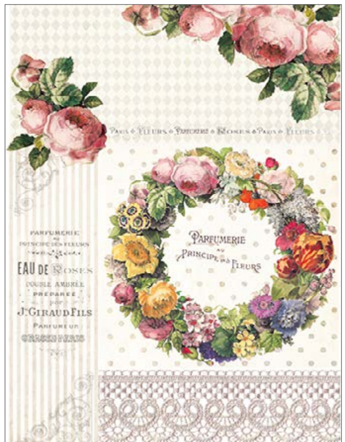
TCR 16 printed on rice paper 25 gr